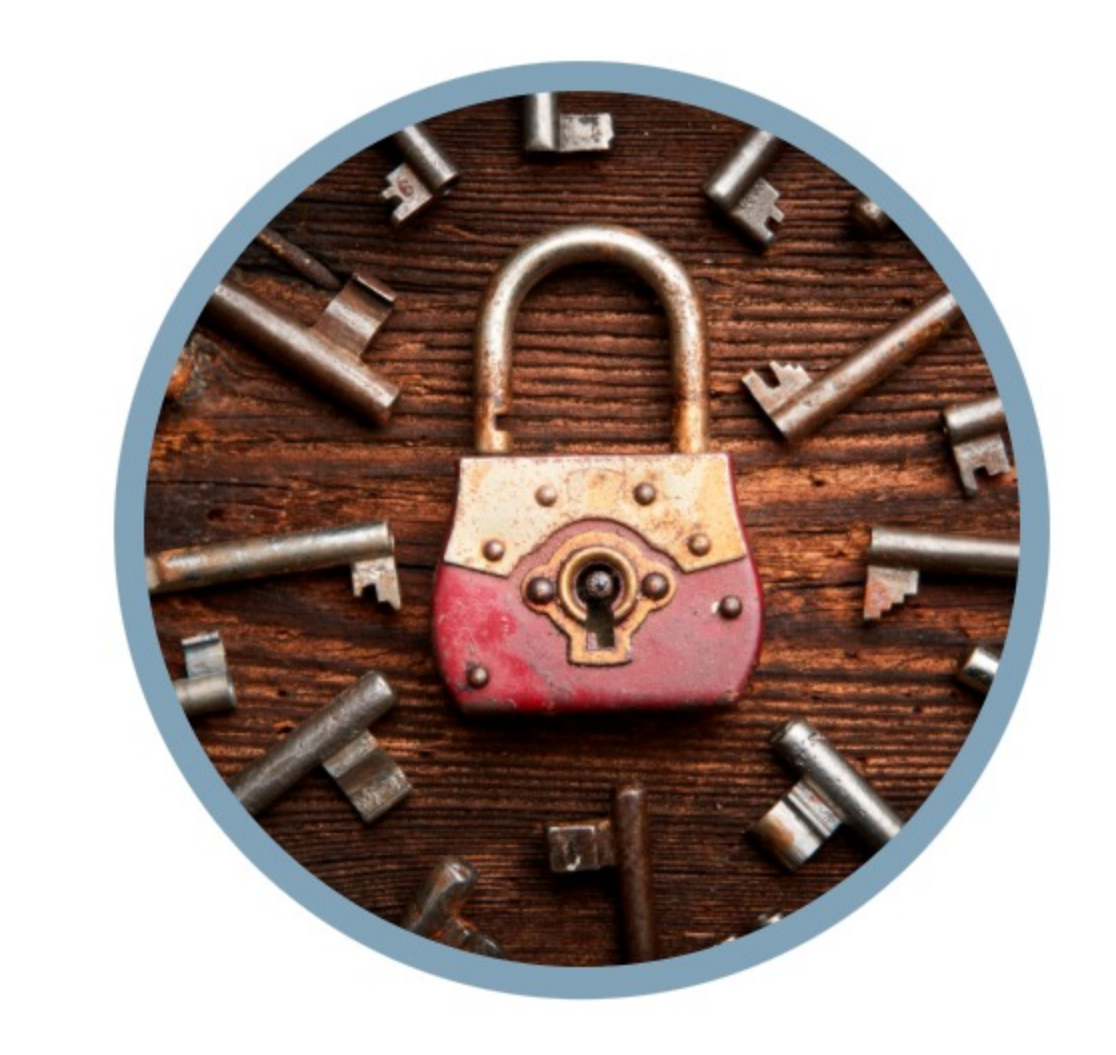
HOW DO WE ACCESS THE RESOURCES?

You have a family member who was recently ill or injured. You, and/or they, experienced Health Care at one or more levels (hospital, skilled nursing, etc.) and likely it was confusing and overwhelming .