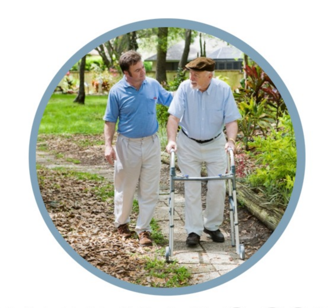
WHAT BENEFITS COME FROM USING THESE RESOURCES?

Navigating through the Health Care Systems is challenging for even Health Care Providers. That is why we created THE BRIDGE.